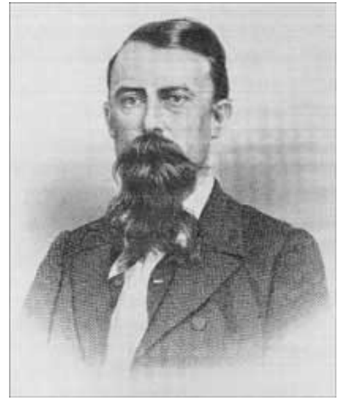
General Joseph O. Shelby (1830-1897).

The rebel president, Jefferson Davis, was actually arrested while fleeing south to join this colony in Mexico.... Of course all the generals and their soldiers were expelled from Mexico when the Maximilian empire fell.