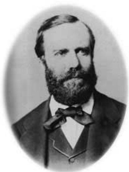
Theodore Roosevelt Sr., (1831-1877), was the father of President Theodore Roosevelt. During the Civil War, he paid a substitute $300.00 to fight his battles!!