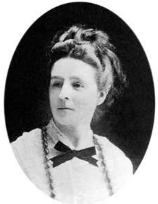
Martha Bulloch Roosevelt (1835-1884), was the brother of James D. Bulloch and the mother of President Theodore Roosevelt.

All the CONFederates were forgiven for their treason . . . except Bulloch....He was never allowed to set foot in the U.S. and died in Liverpool, England in 1901.