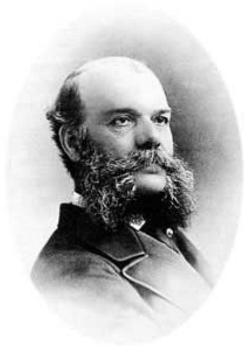
CONFederate commerce raider shipbuilder James D. Bulloch (1825-1901), was the brother of Martha Bulloch Roosevelt.