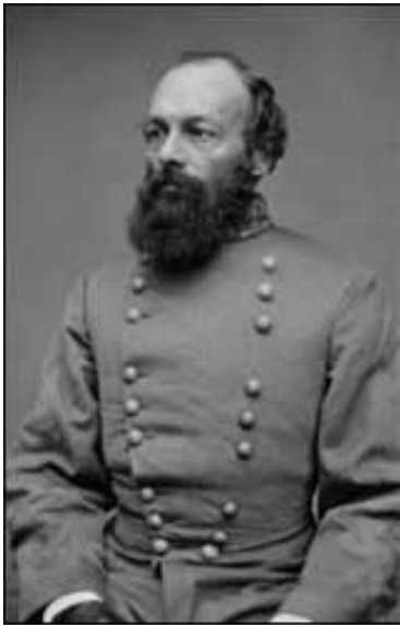
General Edmund Kirby Smith (1824-1893).