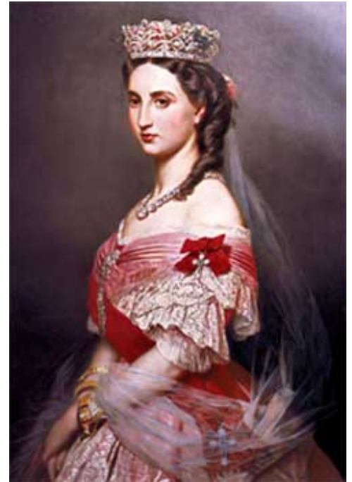
Empress Carlota of Mexico (1840 - 1927).

Maximilian and Carlota were installed as emperor and empress of Mexico with a grandiose plan of becoming rulers of the CONFederacy should the South win the Civil War!!