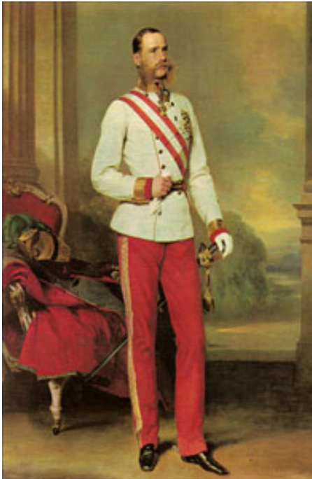
Emperor Maximilian of Mexico (1832-1867).

As the war ended, the CONFederates had one last card left to play....Emperor Maximilian still had 30,000 soldiers in Mexico and the CONFederates hoped to join them there and continue the war from that country.