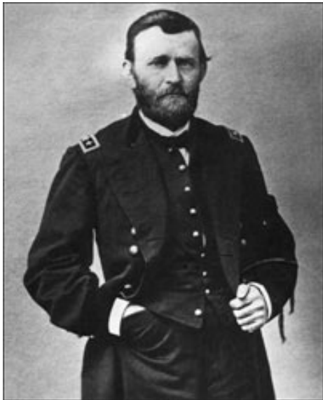
General Grant led the Union forces to victory in ROUND ONE of the Civil War.

The Romans—the premier warlike state in the ancient world—understood this perfectly and they always tried to completely annihilate their foes.