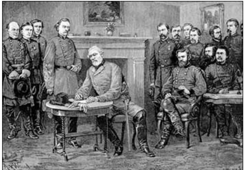
General Lee was forced to sign the documents of surrender at Appomattox Courthouse on April 9, 1865.

This surrender at Appomattox was just a TRUCE before the next round would begin.