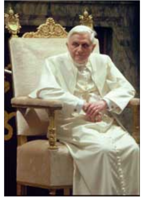
White Pope Benedict XVI.

Since the official founding of the Jesuits by Pope Paul III in 1540, there has been a total of 46 White Popes.