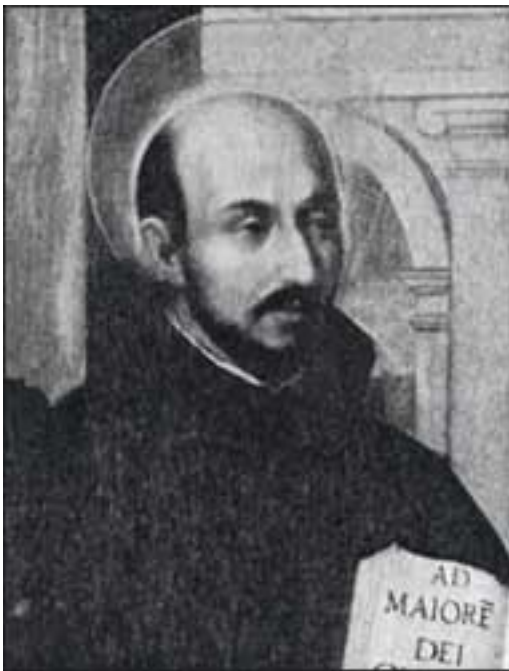
Ignatius Loyola was the first Jesuit general.

This secrecy is absolutely necessary because of the age-old Italian hostility to the Spanish because of the abominable behavior of the Borgias, and the Sack of Rome in 1527 in order to prevent the divorce of Henry VIII from Catherine of Aragon.