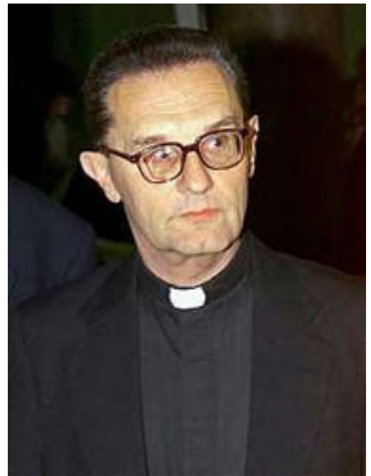
Adolfo Nicolás is the 30th and latest Jesuit general.

Since the official founding of the Jesuits 468 years ago, there has been a total of 30 Black Popes.