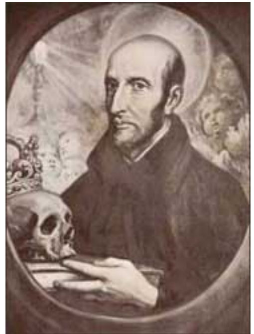
Don Francis Borgia (1510 - 1572). Jesuit general from 1565 to 1572.

Don Francis Borgia—known as the Duke of Gandia—was the great-grandson of Pope Alexander VI, and co-founder of the Jesuits. On his mother's side he was descended from King Ferdinand of Aragon.