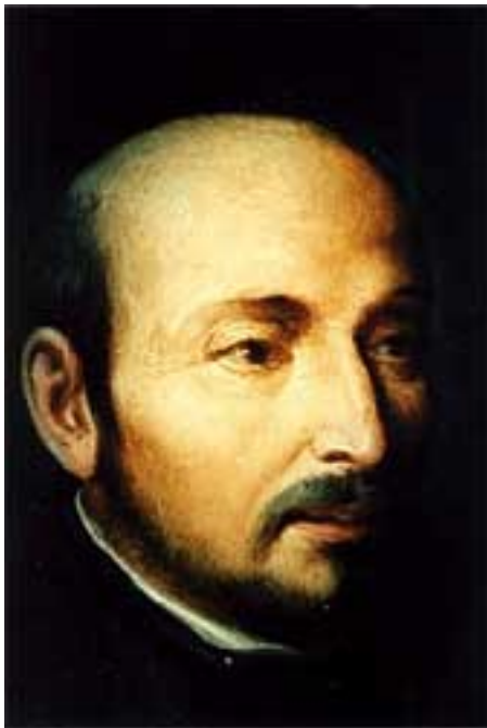
Ignatius Loyola (1491-1556). Jesuit general from 1541 to 1556.

Don Francis Borgia—known as the Duke of Gandia—was the great-grandson of Pope Alexander VI, and co-founder of the Jesuits. On his mother's side he was descended from King Ferdinand of Aragon.