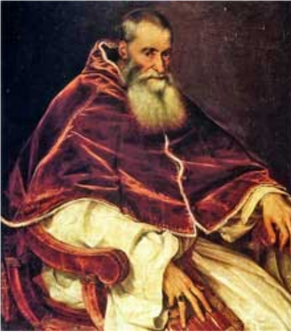
Pope Paul III officially recognized the Jesuits in 1540.

These men live in the very same city—Rome....Both are elected for life; they eat the same food and breathe the same poisoned air, so we should find a close similarity in length of reigns between the two Papal dynasties.