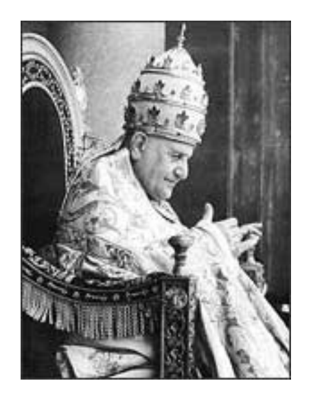
"Good Pope" John XXIII (Pope from 1958 to 1963).

The General at that time was Jean-Baptiste Janssens. Under orders from his General, Pope John XXIII inaugurated the Trojan horse ecumenical movement or Vatican Council II.