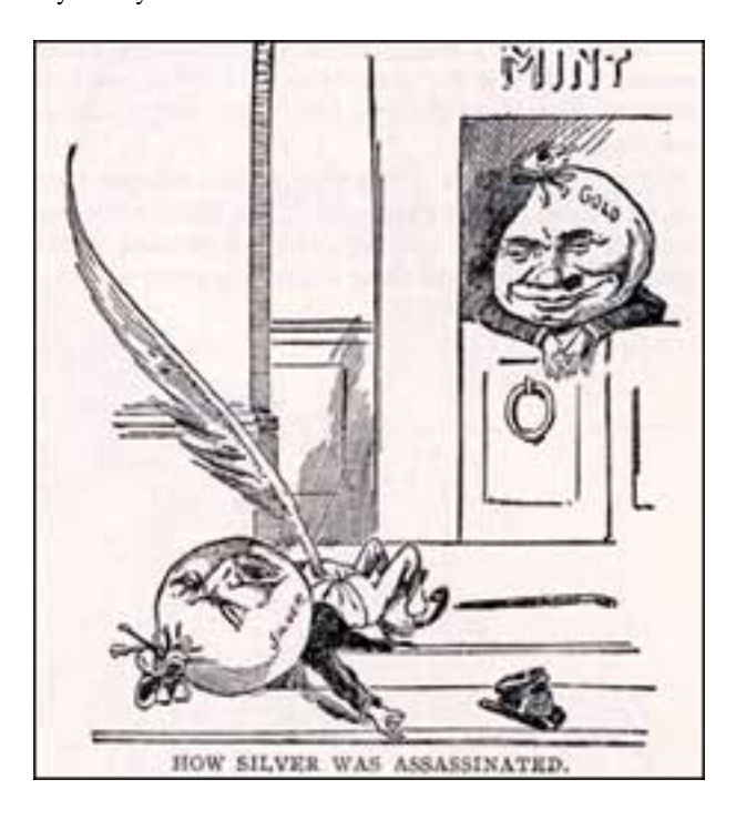
Gold -- the rich man's money -- was now king.

With half the world's money supply demonetized, gold became an even more precious commodity and an item to be hoarded. Tons of it left the United States. The death of silver led to the fake money or paper system and usury on a colossal scale.