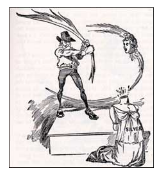
Silver -- the people's money -- was assassinated by a simple stroke of the pen in 1873.