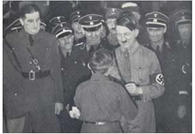
Hitler presents an award to a Nazi youth in the Sportpalast in Berlin