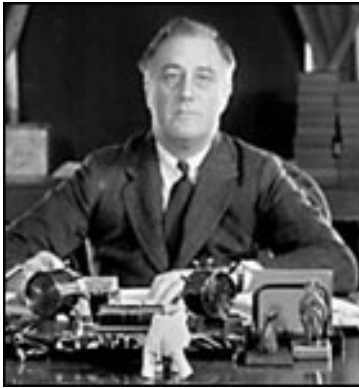
Franklin Delano Roosevelt (1882-1945). Dictator of the U.S. from March 1933 to April 1945.

All that is necessary for evil to triumph is for good men to do nothing!!