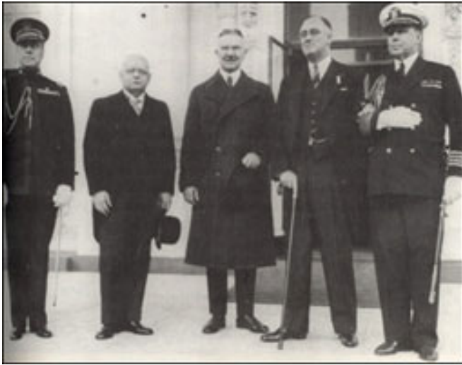
Hjalmar Horace Greeley Schacht (1877-1970) shown here with President Roosevelt in 1936.

He was indicted for war crimes at Nuremburg but his friends in high places had him acquitted while the other criminals were hanged.