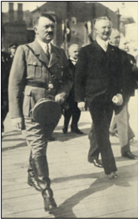
Horace Greeley Schacht (1877-1970) with Hitler in 1934, at the laying of the foundation stone of the new Reichsbank building.

Schacht became President of the Reichsbank by murdering his predecessor!!