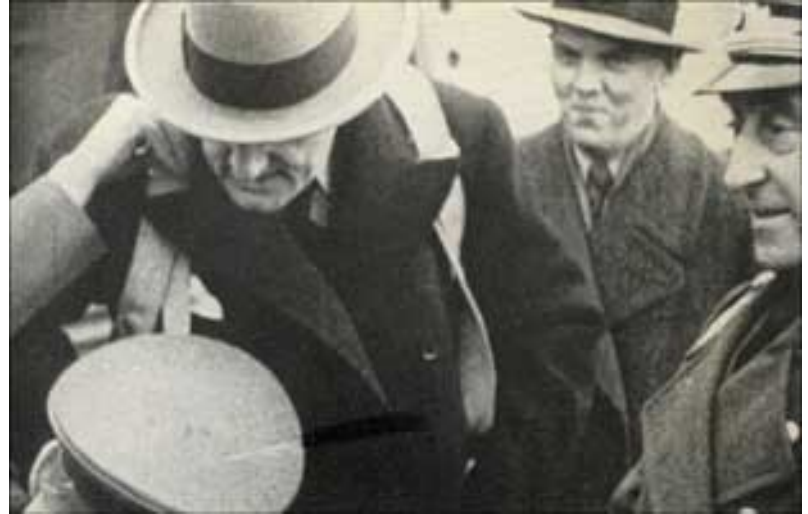
Preparing to escape from Nazi Germany in 1937....Nobody left alive without Hitler's permission. His real mission was to convince Roosevelt to stay out of the war until Russia was defeated!!