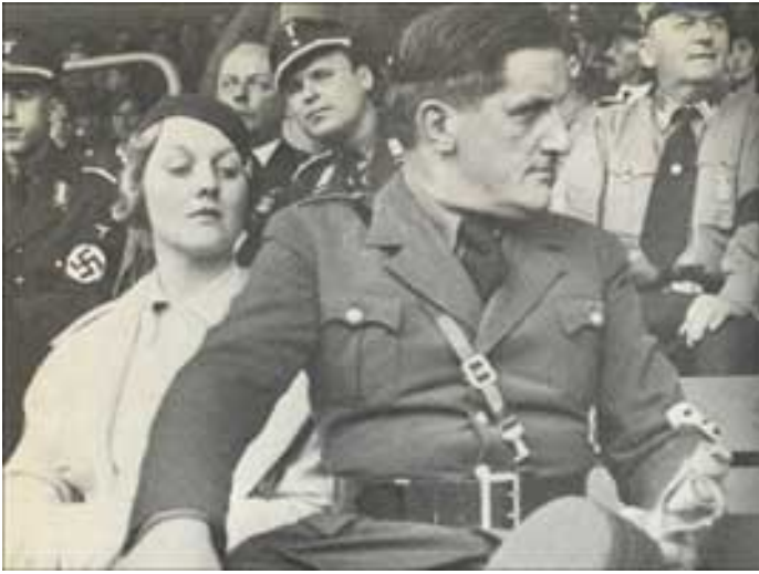
Hanfstaengl with Unity Mitford, the English Nazi, in 1934.