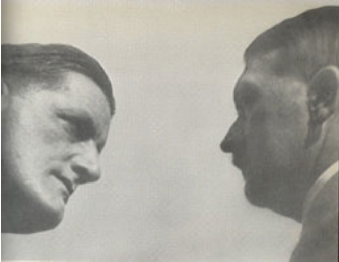
Hitler and Hanfstaengl see eye to eye!!