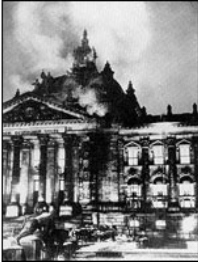
Reichstag Fire in Feb. 1933.

Roosevelt's friend Ernst Sedgwick Hanfstaengl was actually in the Chancellery Building when the fire started.