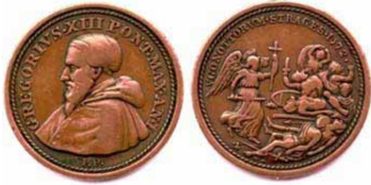
Medal struck by Pope Gregory XIII to commemorate the slaughter of over 100,000 French Christians!!