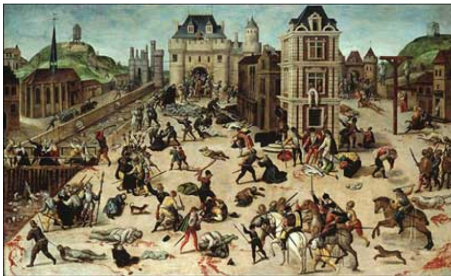
Blood flowed like a river on the streets of Paris.

Pope Gregory was jubilant when news of the massacre reached the Vatican!!