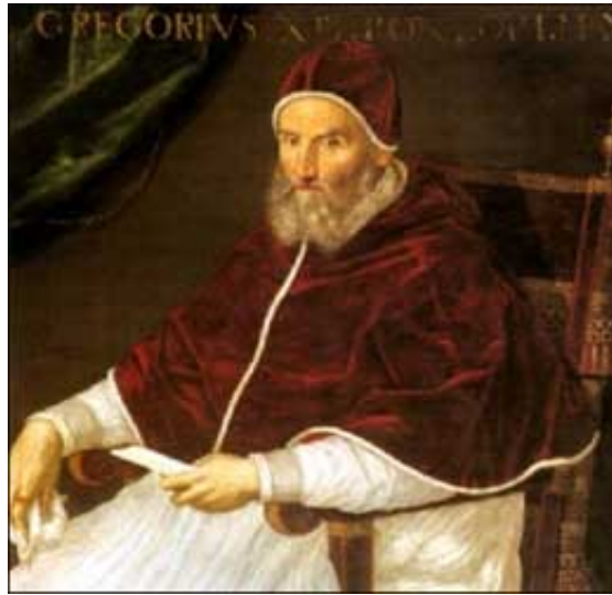
Gregory XIII (1572 to 1585)