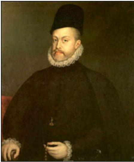
King Philip II (1527-1598). King from 1556 to 1598.