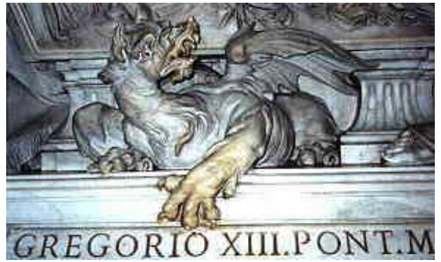
Pope Gregory XIII had the great red dragon of Satan as his heraldic symbol!

This is the same Pope Gregory XIII who MASSACERED the calendar in 1582 by omitting 11 days from the month of October. At the present time, the Gregorian calendar is used in most countries of the world.