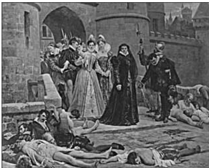
Scene from the massacre of the Huguenots in Paris.

Many were imprisoned—many sent as slaves to row the king's ships—and some were able to escape to other countries. . . . The best and brightest people fled to Germany, Switzerland, England, Ireland and eventually the United States, and brought their incomparable manufacturing skills with them. . . . France was ruined. . . . Wars, famine, disease and poverty finally led to the French Revolution—the guillotine—the Reign of Terror—the fall of the Roman Catholic monarchy—atheism—communism, etc., etc.