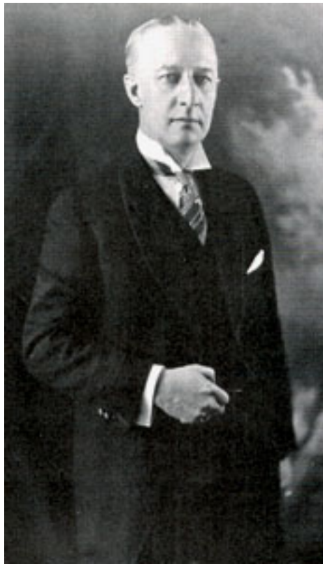
New York Governor Alfred E. Smith (1873 - 1944).