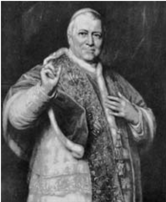
Pius IX (1846 - 1878).

The French troops upholding the last remnants of the Pope's temporal power had to be withdrawn to oppose the invading Prussian soldiers. The Italians rushed into Rome and proclaimed the United Kingdom of Italy with Victor Emmanuel as king.