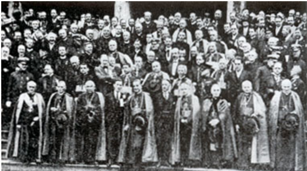
Al Smith (center) and the other Cardinals on the steps of City Hall in 1926.

Al Smith was the Roman Hierarchy's candidate for President in 1928. He was from the lower East Side of New York City. His grandfather came to the U.S. from Italy in 1844 and he probably heard Professor Gavazzi preach in 1854. His grandmother was from Co. Westmeath in Ireland.