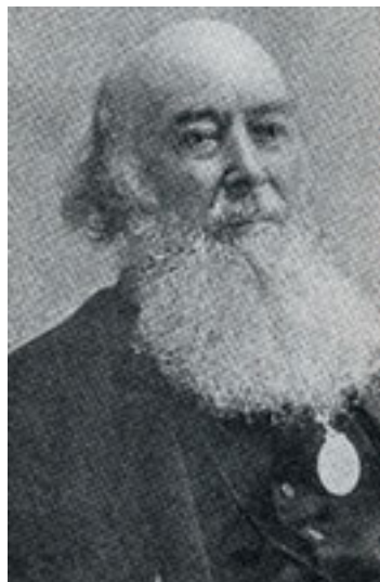
Father Charles Chiniquy, French Canadian priest and friend of President Lincoln. He was the author of Fifty Years in the "church" of Rome, Forty Years in the Church of Christ, The Priest, the Woman and the Confessional .