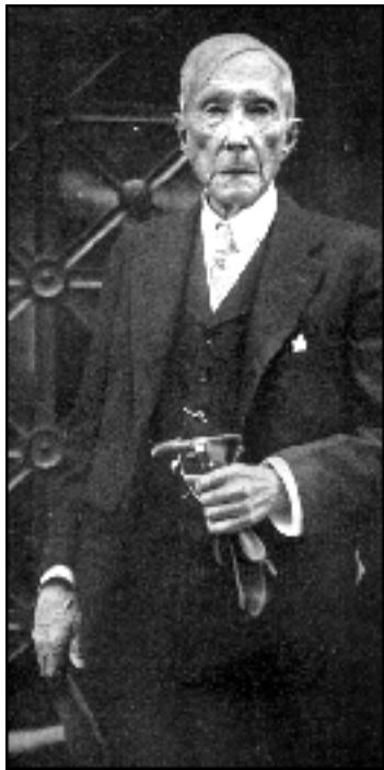
John D. Rockefeller (1839-1937).