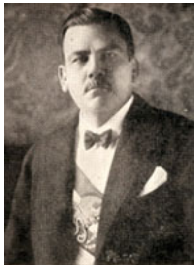
His Excellency Plutarco E. Calles, reforming President of Mexico from 1924 to 1928. He gave Rome the boot in his country.