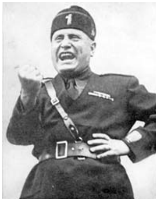
Benito Mussolini "We have 8 million bayonets"

Vatican City State is a Government within a Government. Its head—the Pope—is not even elected by the residents of the state. It is not subject to the lawful rulers in Italy. It has its own police force, post office, radio station, publishing house, TV station, and ambassadorial staff. The Papal ambassadors are called Nuncios or Legates. They are assigned to any country of the world that will accept them and recognize them as Deans of the Diplomat Corps —above every other diplomat.