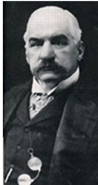
J.P. Morgan (1837-1913).

Multi-millionaire Roman Catholics like John D. Rockefeller and J. P. (Pontifex Maximus) Morgan began to send millions to the Italian Government to persuade them to let the Pope stay!!