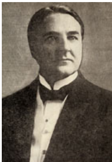
Senator J. Thomas Heflin from Alabama was the voice of patriots in Wash. D.C.